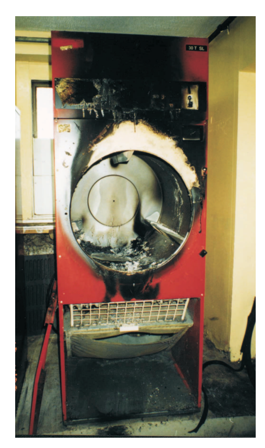
Fig. 2. The second drier.

there was no evidence that the fire was the result of an electrical fault or gas escape. Arson was not suspected.