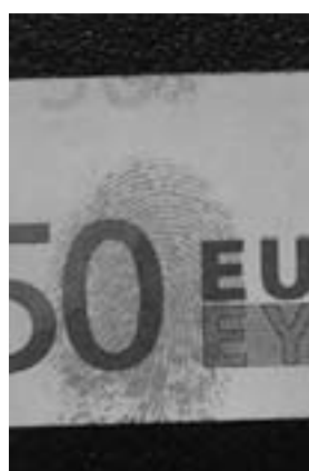
Fig. 11. 50 €, 5-day old.