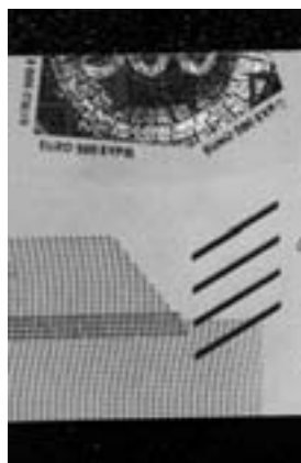
Fig. 3. 500 €, 5-day old.

As the use of UV excited fluorescent powders and stains is unsuitable for cyanoacrylate treated fingerprints on these multiple porosity surfaces, vacuum metal deposition was carried out as a sequential procedure to locate fingerprints.