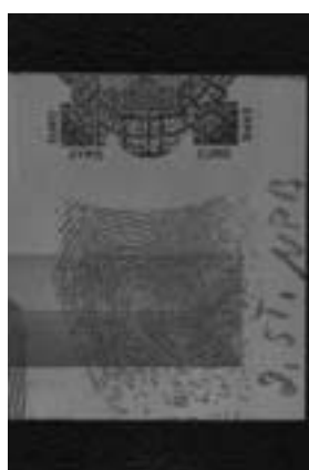
Fig. 10. 50 €, 5-day old.

In principle, fingerprints on the banknotes can be visualised with ninhydrin. The majority of fingerprints developed appeared the typical strong violet colour of Ruhemann's purple. As expected, the method presents some limitations, especially in areas with strong colours, similar coloration or patterned backgrounds (Figure 10, 11, 12, and 13).