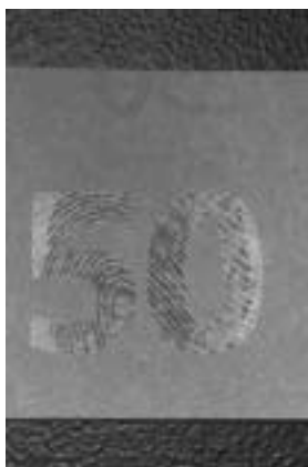
Fig. 8. 50 €, 5-day old.