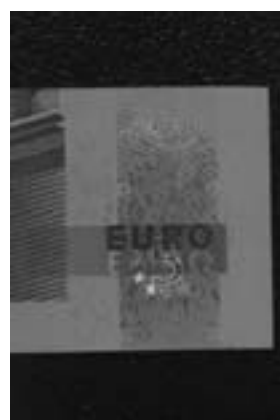
Fig. 20. 5 €, 5-day old.