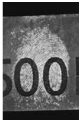
Fig. 15. 500 €, 5-day old.