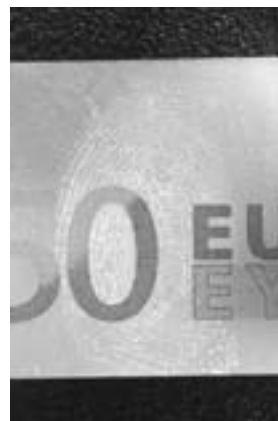
Fig. 9. 50 €, 5-day old.

The vacuum metal deposition procedure turned out to be of only limited suitability. The fingerprints visible at a glancing angle have a low contrast and are therefore difficult to image. Due to the higher cost this method is not suitable for processing a large number of notes. However, it may be considered for more important/serious cases.