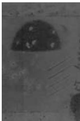
Fig. 2. 500 €, 5-day old.