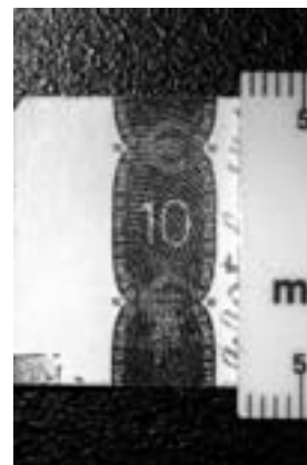
Fig. 6. 10 €, 5-day old.

Cyanoacrylate fuming is suitable only for specific areas of the banknotes.