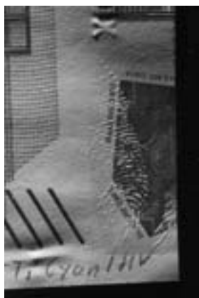
Fig. 4. 500 €, 5-day old.

In some cases, additional fingerprints were visible on the obverse side of the notes when viewed at an angle (Figure 7, 8, and 9).