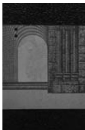
Fig. 19. 10 €, 5-day old.