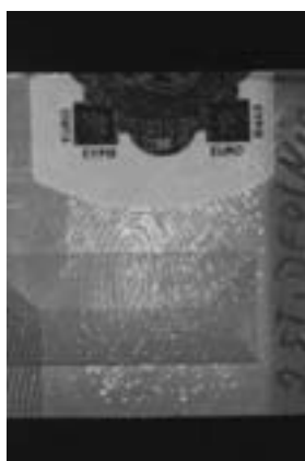
Fig. 14. 50 €, 5-day old.