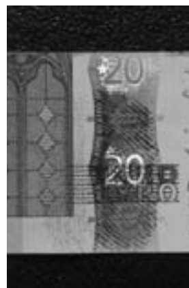
Fig. 21. 20 €, 5-day old.