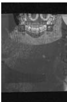
Fig. 7. 100 €, 5-day old.