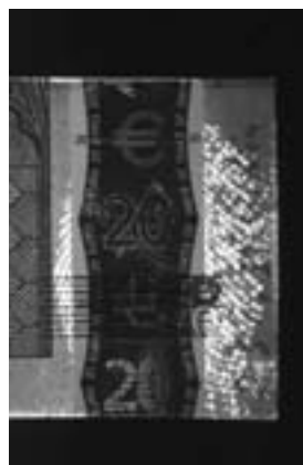
Fig. 17. 20 €, 5-day old.

With one exception, visualisation of usable prints was once again impossible on the problematical areas of the notes.