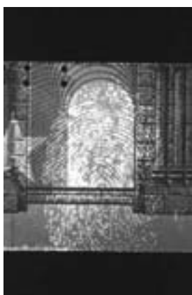
Fig. 16. 10 €, 5-day old.