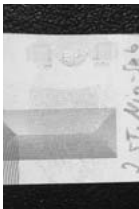
Fig. 18. 50 €, 5-day old.