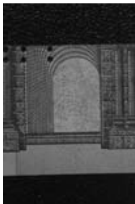
Fig. 12. 10 €, 5-day old.