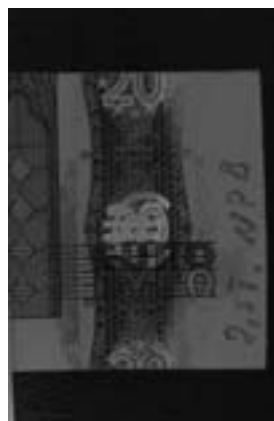
Fig. 13. 20 €, 5-day old.